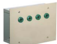
Ground Module GS1204NI