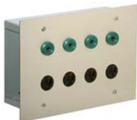
Powerlock/Ground Module RM1204NI