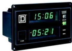
Dual Display Digital Clock Timer MCT12B

Instructions: Combine the unit part numbers to build the desired panel. The catalog number must begin with "AP" and corresponding number to follow. For example, APCTRMARMA4N4 will produce a panel containing a MCT12B clock/timer with a MCTCT remote control, a M5IAI remote alarm indicator, a AM/FM/CD multi-play music center, four HBL8310R receptacles, and four SLR3 ground jacks.