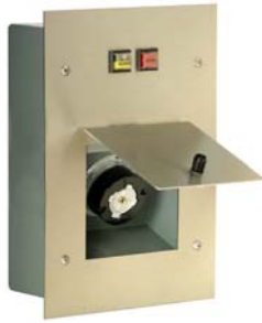
Receptacle and Indicator Module XRIAl-XRIADl