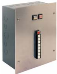
Remote Push Button Station and Alarm 8CIIAl