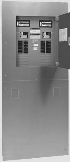
Duplex Isolation Power Panel, see page 15-3