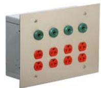
Duplex/Ground Module RMDR1204NI