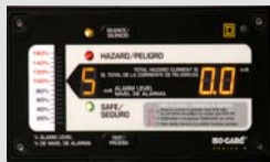
Iso-Gard Line Isolation Monitor (Catalog No.: IGD)