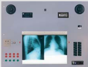
Surgical Facility Panel, see page 15-4