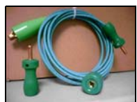
Ground Cord Assembly P753N