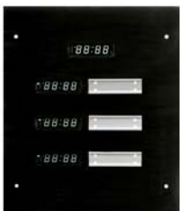
Surgical Chronometer MCT14B

▲ Includes meter for 5 mA LIM. For 2 mA LIM applications, change to catalog number ORICA. 2 mA analog meter available. Contact Schneider Electric.